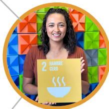
People join with personal commitments.