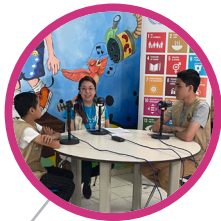
Production of SDG podcasts series