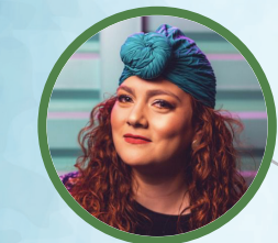
At least 5 influential people and 1 national podcast are amplifying messages about Sustainable Development.